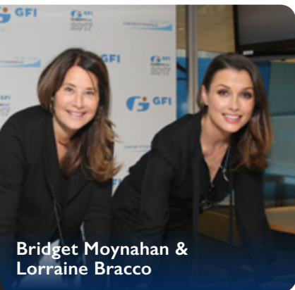
Bridget Moynahan & Lorraine Bracco

Yes, the general public can donate to The Cantor Fitzgerald Relief Fund by visiting our website www.cantorrelief.org or by calling (212) 829-4770.