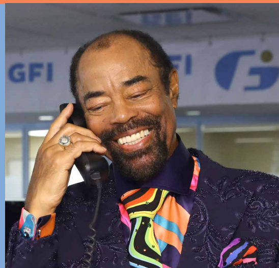
Walt "Clyde" Frazier

Yes, the general public can donate to the Cantor Fitzgerald Relief Fund by visiting our website www.cantorrelief.org or by calling (212) 829-4770.